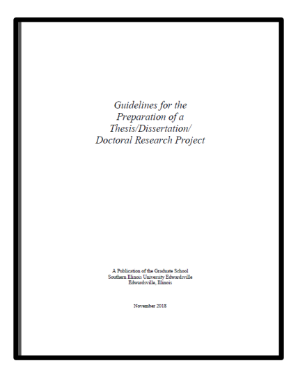
Figure 1: Thesis Guidelines

Throughout the years the Graduate School has worked to refine the thesis formatting process to make it as comprehensive and student-friendly as possible. Towards that aim, many resources have been developed to help students format their thesis as painlessly as possible.